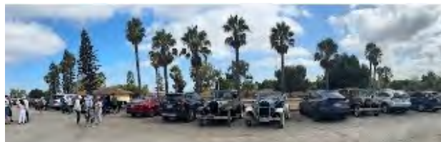
47 members and 15 club cars. A VERY good turnout!