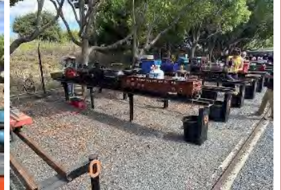
Row of work stations for the hobbyist.