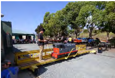
Remote control to bring trains out of storage bin and over to work station.