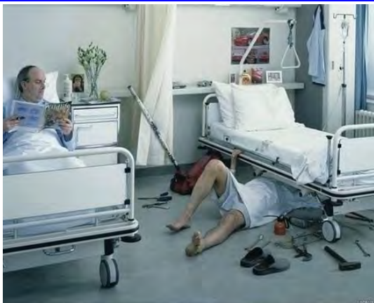
What happens when Old Car Guys get sent to a nursing home ...

Not in jail, not in a mental hospital, not in a grave ... I'd say I'm having a pretty good day.