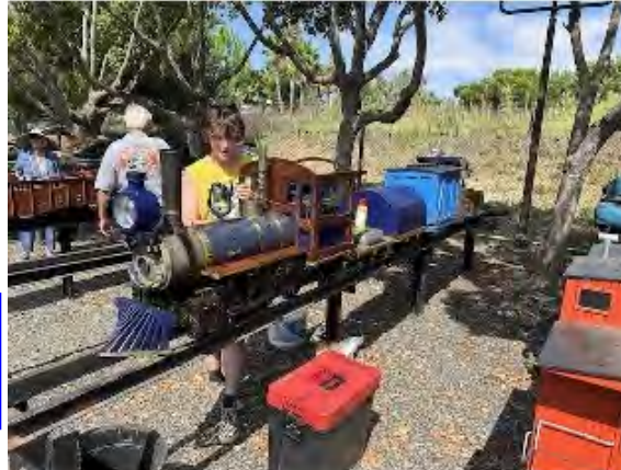
A younger mini-train enthusiast with his BEAUTIFUL steam train. And yes, it actually runs on steam!