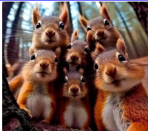
Squirrels will often gather and stare at spectacular nuts.....kind of like they are doing right now....