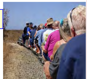
Kids being kids!